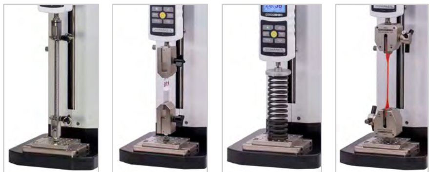
> Typical applications (l to r): extension spring testing, peel testing, compression spring testing, tensile testing