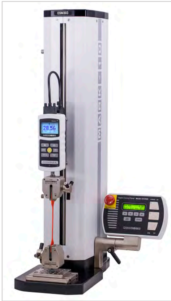
^ ESM303 is shown above configured for a tensile test, with a Series 7 force gauge and G1061-2 wedge grips.

The ESM303 is a highly configurable single-column force tester for tension and compression measurement applications up to 300 lbF [1.5 kN], with a rugged design suitable for laboratory and production environments. Sample setup and fine positioning are a breeze with available FollowMe™ force-based positioning - using your hand as your guide, push and pull on the force gauge or load cell to move the crosshead at a variable rate of speed.