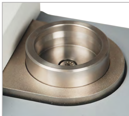
WT3003 Machinable blank terminal fixture For unique sample shapes and sizes.