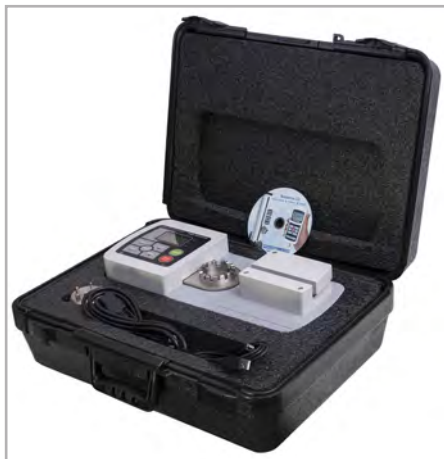
WT3004 Carrying case Provides storage space for the WT3-201M tester, optional ring terminal fixture, power cord, USB cable, and accessories.