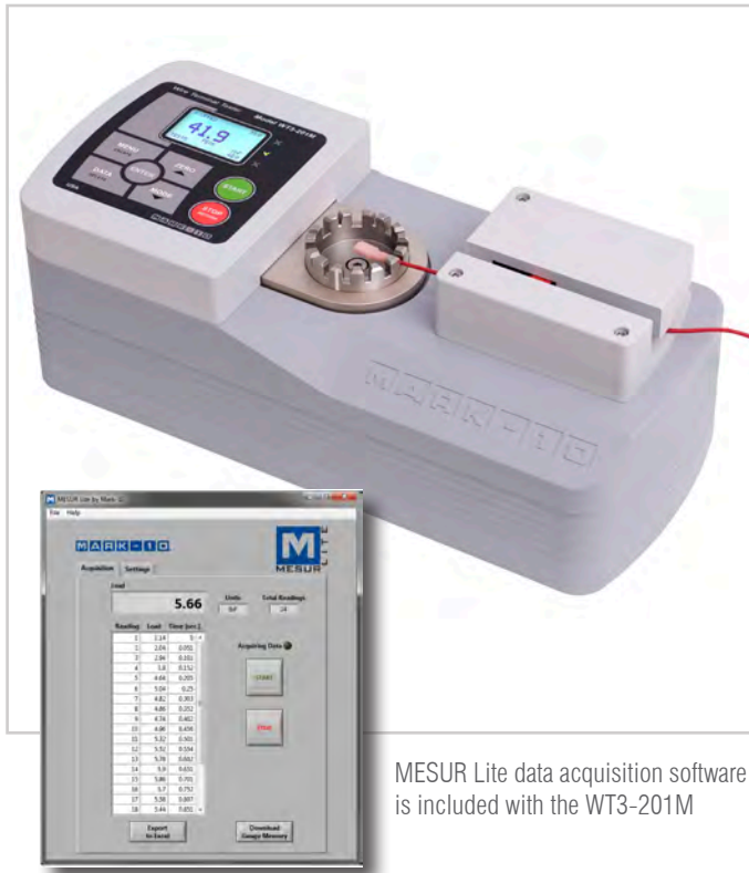
MESUR Lite data acquisition software is included with the WT3-201M

The WT3-201M motorized wire crimp pull tester is designed to measure pull-off forces of up to 200 lbf [1 kN] for wire and tube terminations. The tester conforms to numerous UL, ISO, ASTM, SAE, MIL, and other requirements for destructive testing. Non-destructive testing is also possible, such as pulling to a load or maintaining a load for a specified period of time, as per the requirements of UL 486A/B. Programmable pass/fail limits with red and green indicators and audio alerts help identify non-conforming samples.