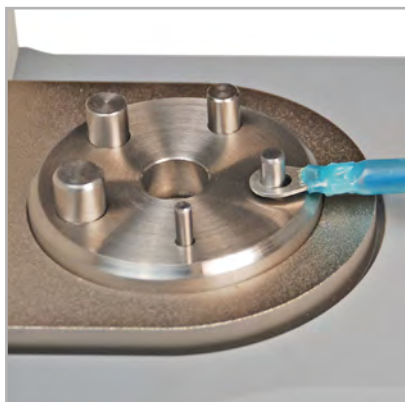
WT3002 Ring terminal fixture Secures ring terminations. Pin diameters from 1/8 to 3/8 in [3.2 to 9.5 mm].