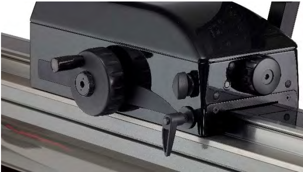
Two locking devices to hold the carriage