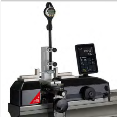
Setting of 2-point bore gauges with holder (TA-SU-313, TA-SU-318, TEL5)