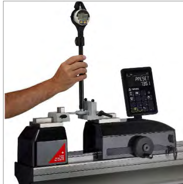
Setting of 2-point bore gauges by hand (TA-SU-301, TEL5)