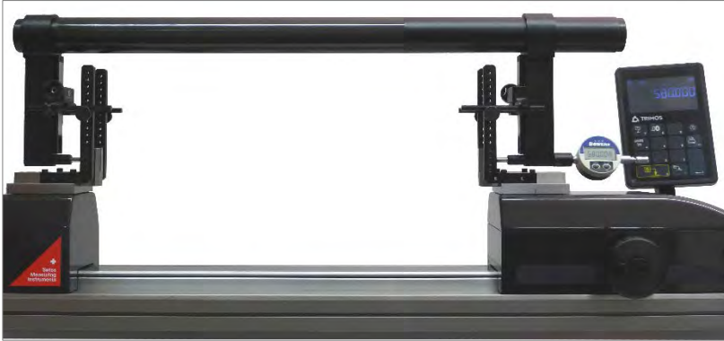
Setting of a large gauge