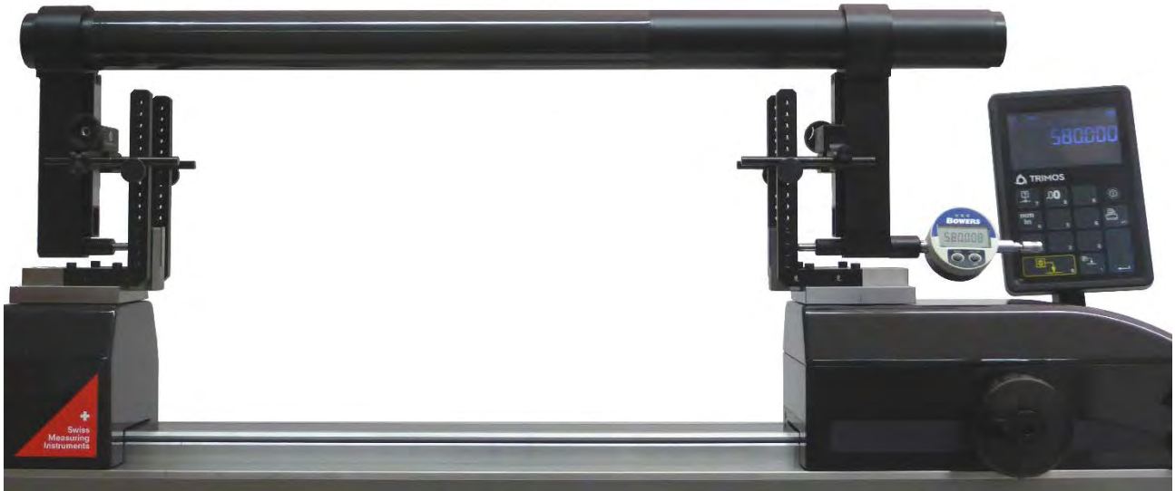
Setting of a large gauge