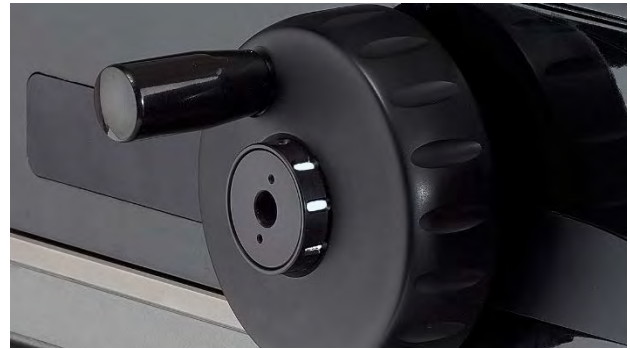
Setting force management with indicator