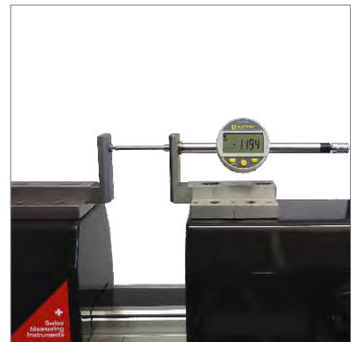
Checking of dial indicator (TEL5CN)