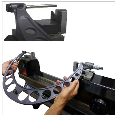
Manually checking of external micrometer (TEL5)