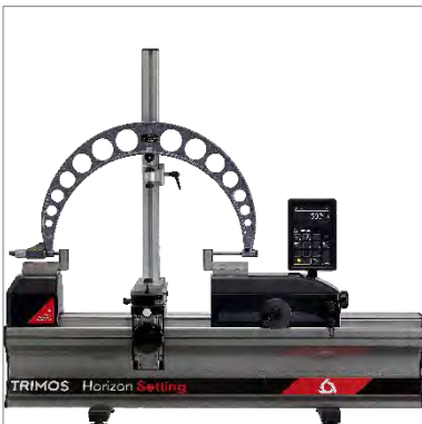
Checking of external micrometer held on a support (TA-SU-313, LABC20.1/SP02, TEL5)